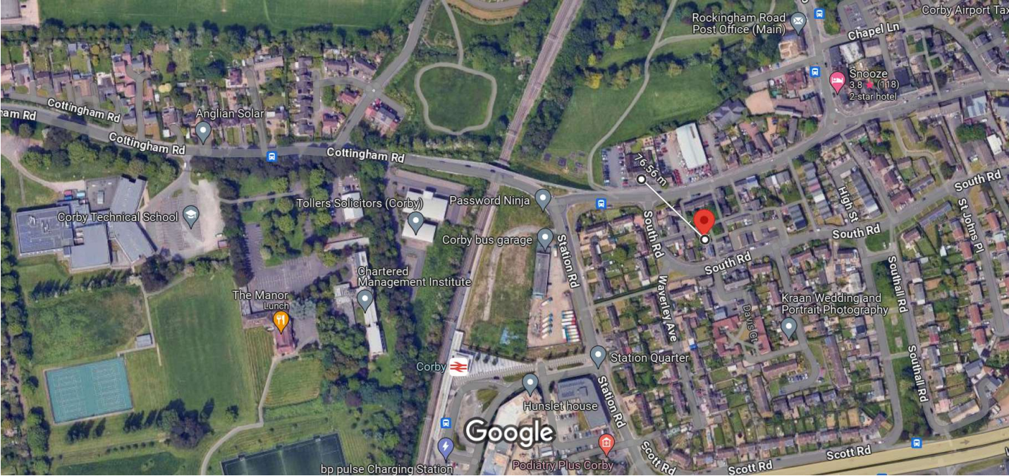
Imagery ©2024 Maxar Technologies, Map data ©2024 50 m

Measure distance Total distance: 76.56 m (251.19 ft)